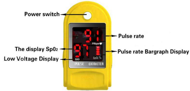
Figure 2. Front View