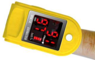
Figure 5. Put finger in position

7.3 Put the patient's finger into the rubber cushions of the clip (make sure the finger is in the right position), and then clip the finger.