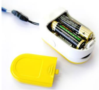
Figure 3. Batteries Installation

⚠ Please take care when you insert the batteries as improper insertion may damage the device.