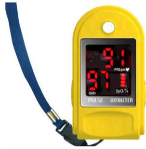
Figure 4. Mounting the hanging rope

Step 2. Put another end of the rope through the first one and then tighten it.